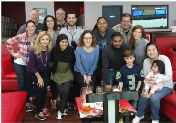
LISHP Networking at a bowling alley