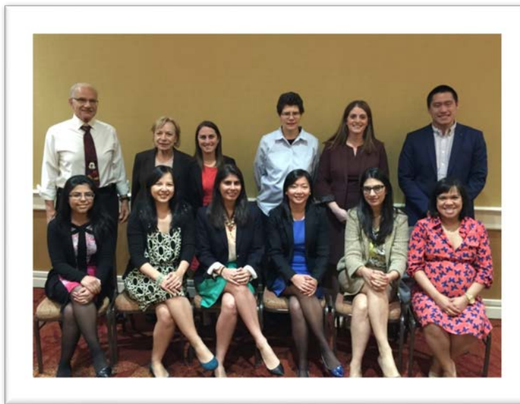
NYSCHP Delegates at the 2015 Annual Assembly Meeting

Interested in serving as a delegate or learning more? Speak to your local chapter leadership and also attend the HOD session at the Annual Assembly in Saratoga! All members are welcome to attend the sessions held in the afternoon - the first session is on Thursday and the second session is on Saturday.